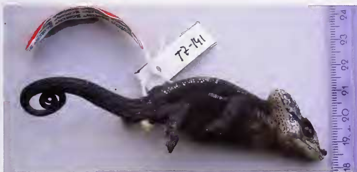
Fig. 3. Holotype of K. u. artytor ssp. n. (photo: N. Lutzmann).

Description of the Holotype (Figs 3–5). MNHG 2612.65, adult male, 1840 m asl, South Pare Mountains, North Tanzania, leg. J. Mariaux & C. Vaucher, 29. 09. 2000. HBL 80.0 mm, TL 100.0 mm, ToL 180.0 mm, HL 31.0 mm, HW 13.0 mm, the belly is cut and the intestine removed, both hemipenes are partly everted, length of lower jaw 21.0 mm, distance from front edge of eye to nostril 9.8 mm, distance from nostril to snout tip 5.4 mm, distance from lower jaw to the tip of casque 7.5 mm, head width between eyes 6.5 mm, canthus temporalis from eye to angle 7.7 mm, canthus parietalis (cp) is bi-forked anteriorly (Fig. 5), distance from bifurcation of cp to the top of